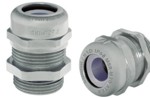
SKINTOP® MSR-M ATEX