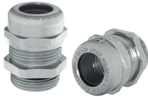
SKINTOP® MS-M ATEX